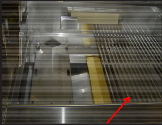
Remove main cooking grids.