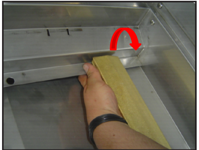
The main burner can now be removed.